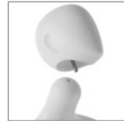
articulated head system