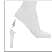
ABFT8 abstract feet with removable high heels