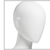
CM egghead with ears