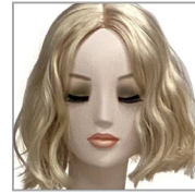
CL with realistic make-up B3