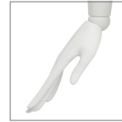
PVC abstract hands (not articulated)