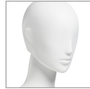
CL abstract head with ears