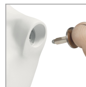
push and pull