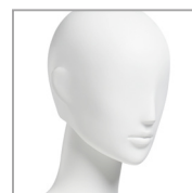
CL abstract head with ears