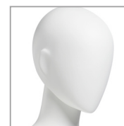
CM egghead with ears