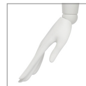
PVC abstract hands (not articulated)