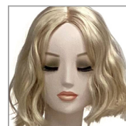
CL with realistic make-up B3