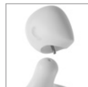
articulated head system