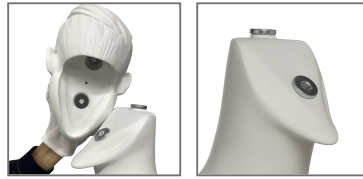
magnetic curved neck