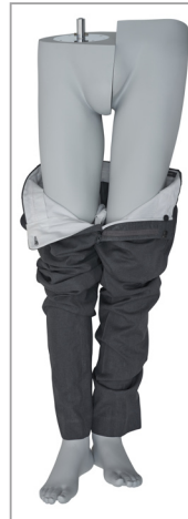
special leg fitting for easy dressing